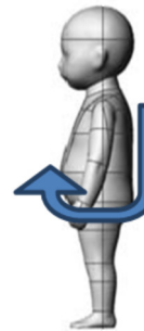
C-7 to navel over the diaper