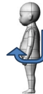
C-7 to navel over diaper